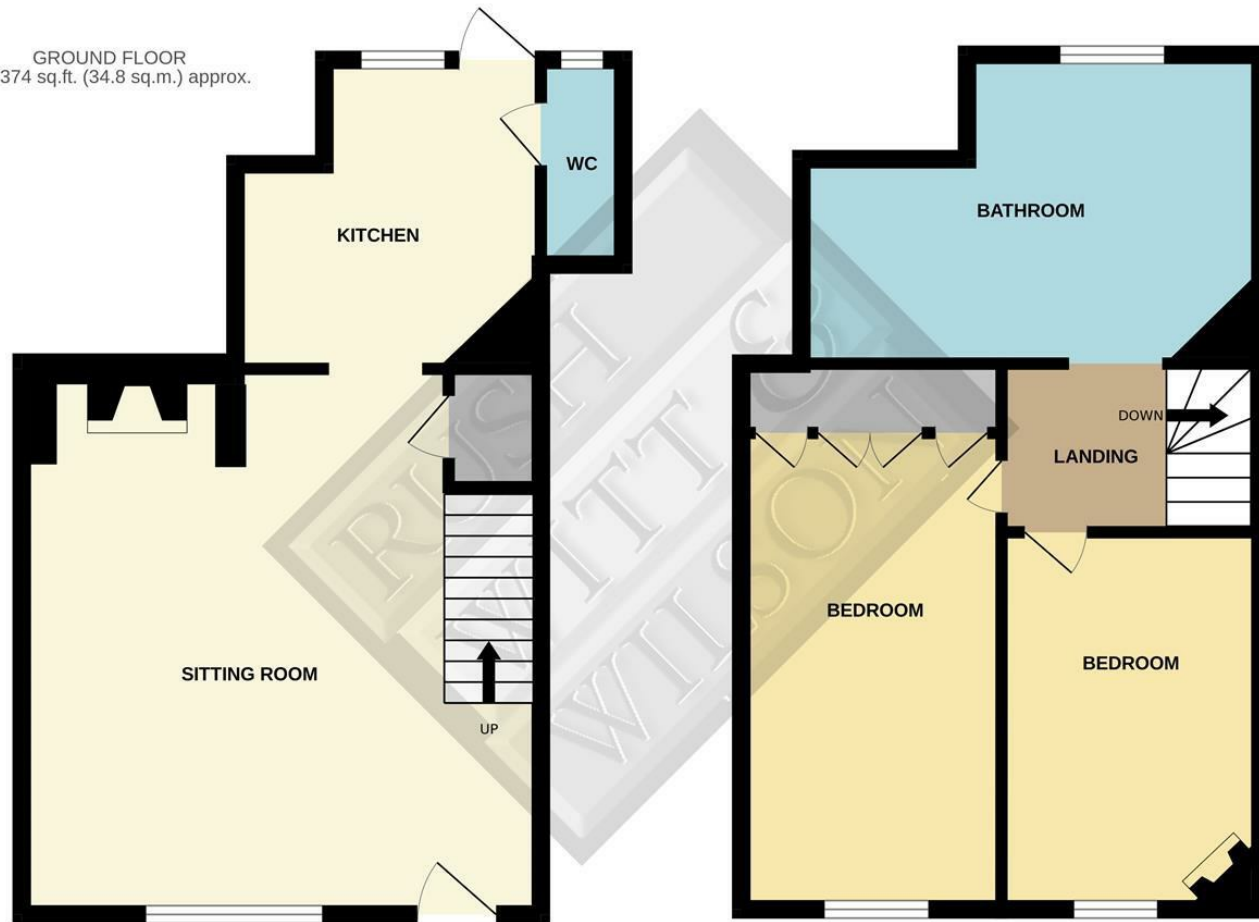
TOTAL FLOOR AREA: 778 sq.ft. (72.3 sq.m.) approx.

Whilst every attempt has been made to ensure the accuracy of the floorplan contained here, measurements of doors, windows, rooms and any other items are approximate and no responsibility is taken for any error, omission or mis-statement. This plan is for illustrative purposes only and should be used as such by any prospective purchaser. The services, systems and appliances shown have not been tested and no guarantee as to their operability or efficiency can be given. Made with Metropix ©2023